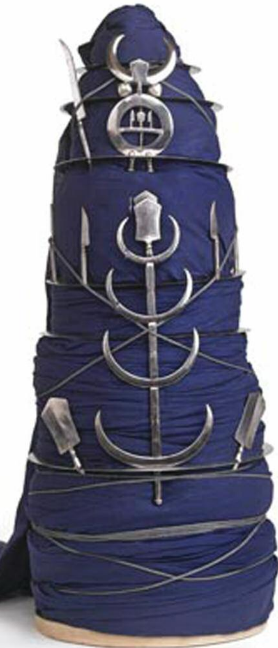
Image: Sikh Akali-Nihang turban (dastaar boonga), 21st Century